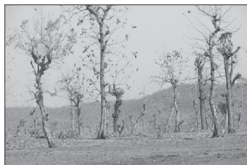
Figure 2. Much of ‘notified’ forestland has ceased to be a forest due to deforestation, soil degradation, and overexploitation.

In the early 1900s, the rising demand for wood and agricultural expansion further led to increasing levels of deforestation. Post-independence population growth and the emergence of the Green Revolution brought even larger tracts of land under the plow and further increased the demand for wood-based energy. These factors, combined with poor land management and reckless government approval for commercial logging drastically reduced forested area in the region (Fig. 2). Today, only small patches remain, of dry miscellaneous and thorny forests comprising dhak ( Butea monosperma ; syn. B. frondosa ), teak ( Tectona grandis ), mahua [ Madhuca indica J. F. Gmel.; syn. M. longifolia Macbride], chirongi ( Buchanania lanzan Spreng.; syn. B. latifolia Roxb.), kardhai ( Anogeissus pendula Edgew.), dhau ( Anogeissus latifolia ), khair [ Acacia catechu (L.f.) Willd.], and thuhar trees ( Euphorbia nivulia Buch.-Ham., E. tirucalli L.).