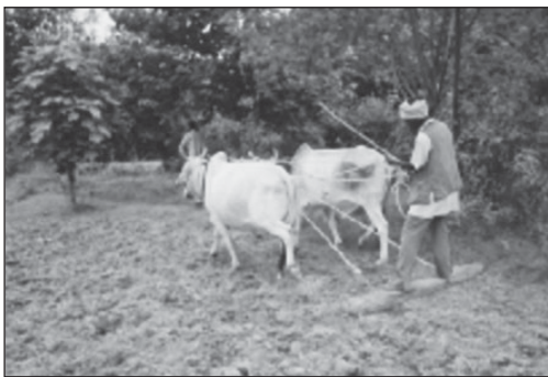
Figure 3. A traditional farmer toiling in his field.

Local inhabitants primarily rely on subsistence rainfed single-crop agriculture and small-scale livestock production for their livelihood, with sorghum ( jawar ), wheat, grams, and oilseeds as the predominant crops. Apart from wheat, the other major crops grown in the area are rice (in some areas), maize, pearl millet, kodo , kutki , chickpea, pigeonpea, green gram ( moong ), black gram ( urd ), soybean, linseed, sesame, groundnut, jute, and vegetables. Cultivators grow pigeonpea, groundnut, sugarcane, and soybean (recent introduction) during kharif ,