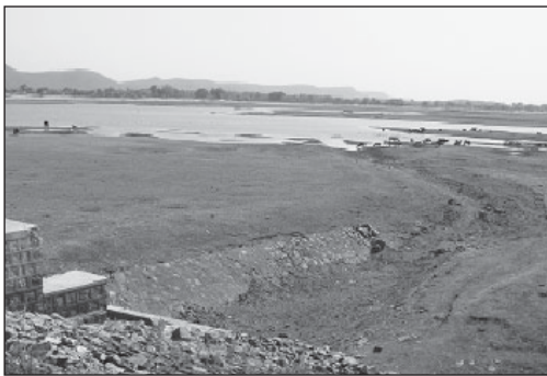
Figure 4. A traditional multipurpose tank.

irrigation in the region. To facilitate pastoral economy, the farmers also conserve rainwater in tanks and in-situ in the field, which increases the fodder availability for animals while recharging the aquifers. Several centuries ago, with the support of rulers like the Chandela and the Bundela, the local people tapped many streams and exploited the sloping topography, by building embankment and water harvesting structures such as lakes and surface-reservoirs in the region (Fig. 4). This extremely scientific tradition continues to this day. Consequently, each village in the region has ponds/tanks to meet the water needs of the inhabitants. Some of the old structures created during the time of the Chandelas and Bundelas are still in use. The Chandelas created a large number of ponds now known as Chandeli-ponds for irrigation and drinking water supply (Fig. 4). For example, in Tikamgarh, the Chandeli-ponds are well scattered in the district. Thus, the area has evolved three traditional irrigation systems: (i) reservoirs, primary surface tanks, and ponds; (ii) inundation irrigation systems; and (iii) in-situ storage facilities. The people of Bundelkhand continue to innovate. For